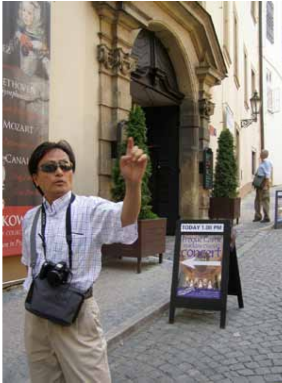
Figure 4. Tourists at the Prague Castle – Zuzana Jurková.

Immediately behind the gates guarded by two members of the Castle Guard is the Lobkowitz Palace on the left side. It is the only private building in the Castle complex. Next to the monumental Baroque portal giant posters hang inviting you to the palace's museum to view Canaletto's pictures of London and also Beethoven and Mozart manuscripts (Figure 4).