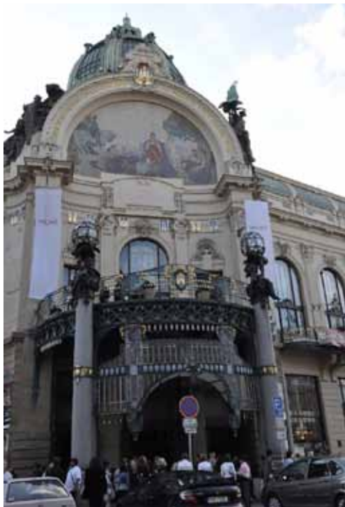
Figure 3. The Municipal House - Zuzana Jurková.