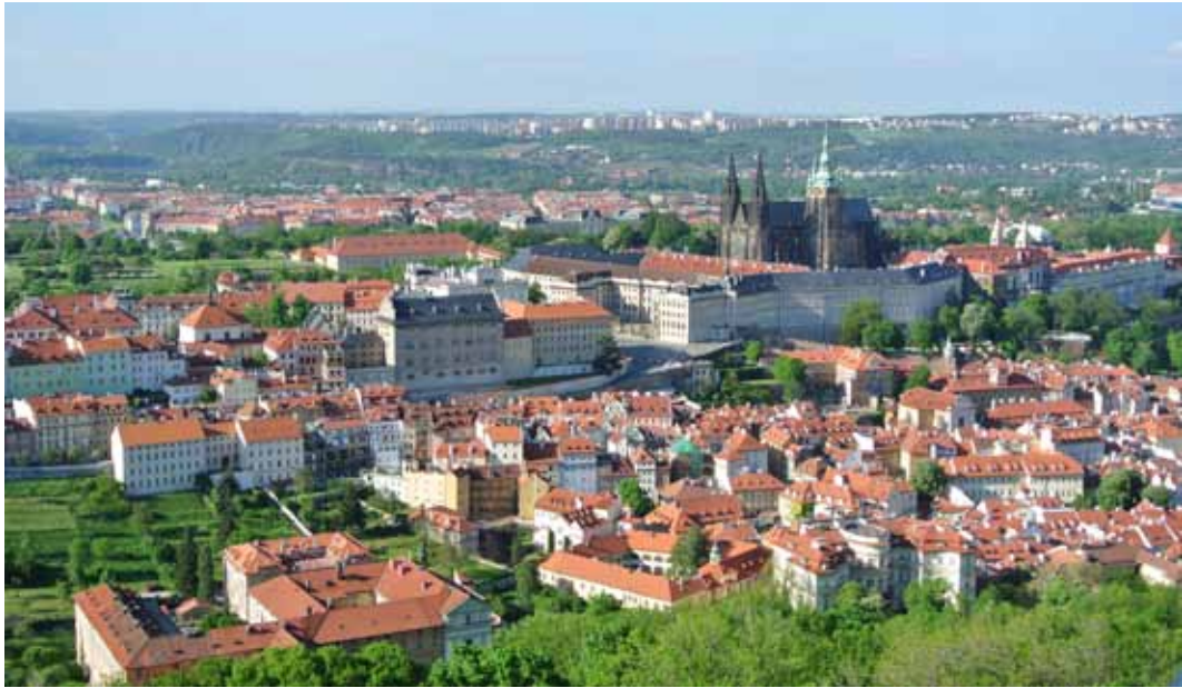
Figure 2. Prague from the Petrín Hill lookout tower - Zuzana Jurková.

I thus get out at the Pohorelec tram stop before three o'clock and head for the Castle (Pražský hrad, see map "A"). My main goal is to scout around for musical events. Twenty minutes later I leave the Castle without success. (Concerts in the Lobkowitz Palace, which are held regularly, are probably on a break.) Among the many tourists, I didn't meet anyone who looked as if he had flyers with an invitation to a concert.