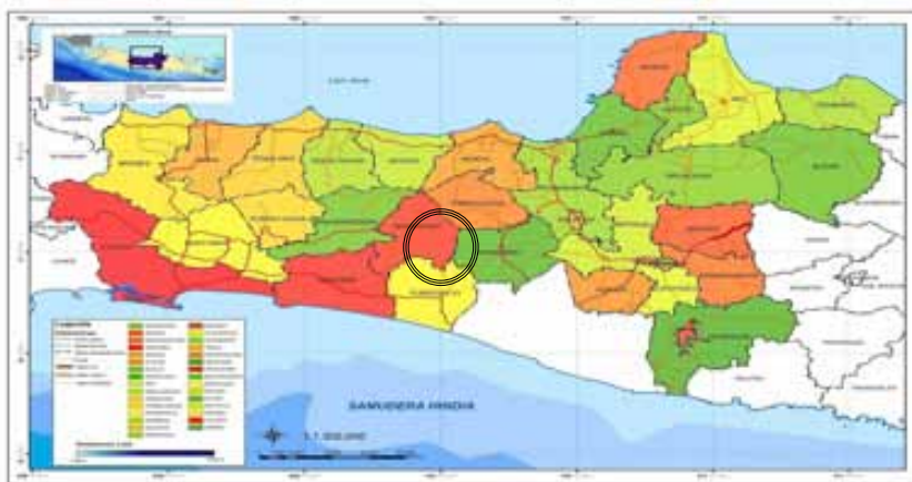
Figure 4. The Location of Parakan within the Island of Java. Source: genericcheapmed08.com, has been accessed on 7th February 2018.