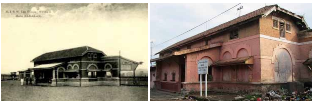
Figures 9. Old train station of Parakan, a historical building from the colonial era, it was the only rail station that brought all soldiers into to Parakan to meet KH Subkhi for Bamboo Runcing production. Source: Left-hand Side: N.I.S.M Lijn Djoaja-KITLV (1910), Right-hand Side: Private Documentation (2017).

In addition, there are also several buildings that represent the colonial era, such as the old railway station. This is from the 19th century, and its function was to bring goods from other cities in Java as Parakan was a well known trading hub in the colonial era. It was also the only station soldiers used to meet KH Subuki to make Bambu Runcing (see Figure 9). As shown, the building is in poor condition as it has been neglected for years, although its structure is still in good condition. This abandoned building should be well maintained and become a primary consideration for the local government.