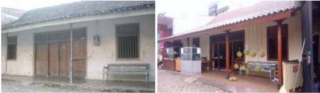
Figure 8. KH Subkhi's House- Left-hand Side: the house during the colonial era before renovation, Right-hand Side: the house in post-colonial era after major renovation, it becomes a restaurant. This house is one historical place from the colonial era and the place of KH Subkhi (the pioneer of Bamboo Runcing) for living and his activities during the colonial time.

had never been open to the public, apart from the middle terrace that used to be for “pengajian” or recitation in groups. After a renovation in 2010 and 2012, it was opened to the public with a restaurant in the front and a residential space at the back. Its form remains the same, with large 4 sectioned doors in the middle of the façade with two adjacent windows.(see Figure 8).