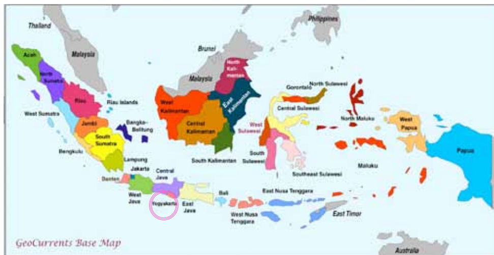
Figure 3. Map of the provinces of Indonesia showing the location of Parakan.

The designation of an area as historical is one that should be made by the local or central government. Indonesia, as a country with many islands and many historical areas, needs to make more effort towards preservation and conservation. One area which has many historical buildings and a significant character of its own is the city of Parakan. It is in the district in Temanggung and is a relatively unknown city as not all Indonesians know about it (see Figures 2, 3 and 4). However, in 2015 it was designated as a heritage city and since this classification many people have been eager to learn about its history and to explore it directly.