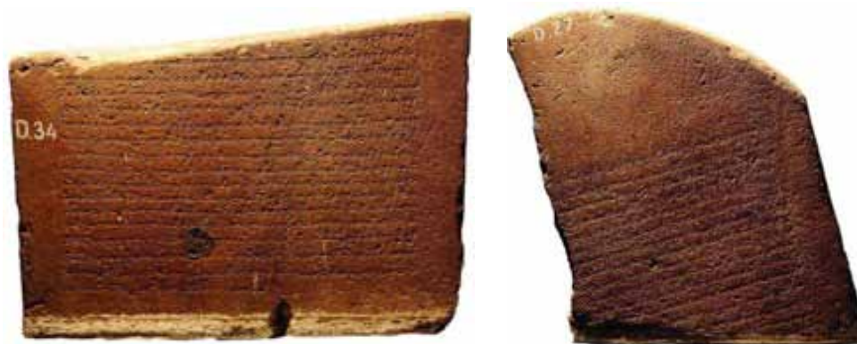
Figure 1. The Prasasti of Kayumwungan, there are only two pieces out of 5 remaining, D34 and D27. This Prasasti of Kayumwungan has been known as Prasasti of Karang Tengah as it was found in the Karang Tengah Village that today is known as Parakan.

Evidence for the existence of Parakan, which had been known as the Karang Tengah Village, is the existence of an inscribed stone named Prasasti Kayumwungan. Its inscription describes the history of the area in ancient Javanese and Sanskrit languages. This stone was found one hundred years ago in the Karang Tengah Village area and is proof of the existence of Parakan, which had been an area for all the rakai during the Mataram Kuno Hindu era. The Prasasti of Kayumwungan should consist of five pieces of stones with ancient Javanese inscriptions, but only two pieces remain (D27 and D34) (see Figure 1). This prasasti, also known as Prasasti Karang Tengah, can be found in the National Museum of Indonesia (Museum Nasional or Museum Gajah).