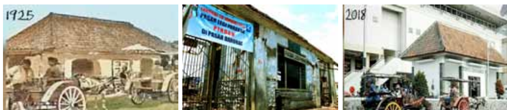
Figure 11. Pasar Legi Parakan is one of historical buildings in Parakan since colonial era in 1925 and it has been demolished and relocated in new place in 2014 and has been finished the construction in 2017. Source: left hand: KITLV (1925), middle: the abandoned Pasar Legi Parakan that had been demolished and relocated in a temporary place in 2013 and has been relocated in the new place in 2014 (Arcom Soekarno, 2013), right: Pasar Legi in its new location and has a semi modern traditional concept (private documentation, 2018).

Parakan, as a heritage city, has various landmarks, one of which is Pasar Legi Parakan (the traditional market of the city). It is called Pasar Legi because it used to operate only on Friday Legi (Legi is part of the Javanese calendar). It was built in the colonial era in 1925 and was only a small single building (see Figure 11) but also accommodated sellers at the front of the building. After years, the building was abandoned and lack of the utility as well as the structure and was finally demolished in 2014 and relocated. Construction of a new Pasar Legi Parakan building began in 2014; the concept of the market is a national standard, with a semi-modern yet traditional form.