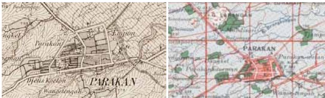
Figure 6. The Map of Parakan from colonial era to post-colonial era.