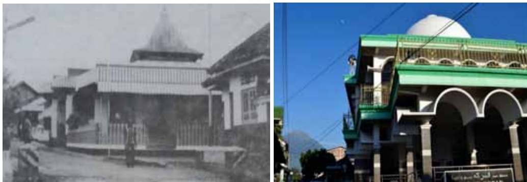
Figure 7. Mosque of Al Barokah Bambu Runcing - Left-hand Side: the mosque in colonial era before renovation, Right-hand Side: the mosque in post-colonial era after a major renovation. This mosque is one of the historical places during the colonial era for making sharpened bamboo as a traditional weapon to fight the Dutch.

One of the activities of KH Subuki and the Indonesian soldiers was to produce as much Bambu Runcing as possible. One of the rituals was to put both bamboo and soldiers in a pool of cool water together for 24 hours (the temperature in Parakan is always under 20 degrees). This tradition was intended to allow the soldiers to obtain strength from Allah SWT. The pool itself is located inside the Masjid Al Barokah. This is why the mosque is known as the Bambu Runcing Mosque. The mosque changed significantly from the colonial to the post-colonial eras. Before independence day, it had a traditional form with similarities of many Javanese mosques, with a pyramid roof known as a Limasan roof. Unfortunately, it did not remain as such, because in the 20th century its form was transformed, becoming more modern with a domed roof (see Figure 7).