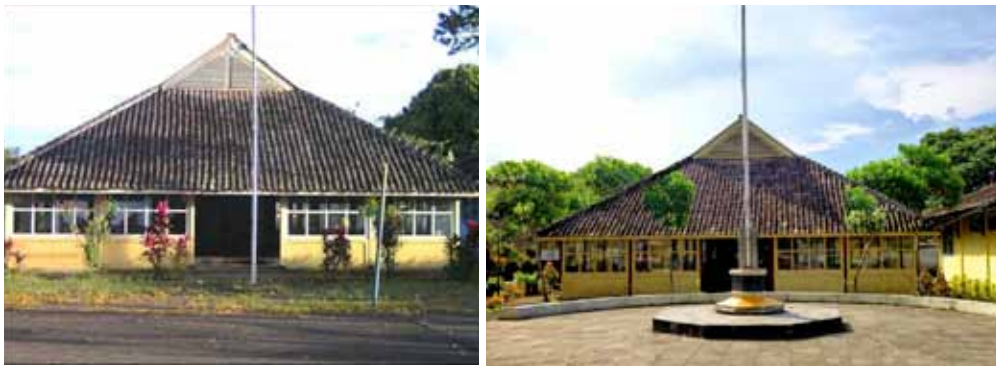
Figure 10. Kawedanan office as one of historical buildings from the colonial era, Left-hand Side: Kawedanan Office in colonial era, Right-hand Side: Kawedanan Office in post-colonial era. Source: Left-hand Side: Wawan Hermawan (1940), Right-hand Side: Private Documentation (2017).

ing was an office for Wedana (the local government in the colonial era, when the country was subject to Dutch policies and regulations). The condition of the building remains the same, but is now unfortunately empty. For some special events, it is used as a hall or exhibition space and sometimes is a meeting place for NPL (Nata Parakan Luwes, a local Parakan community group). It is a classic style building, with a traditional Javanese roof (see Figure 10).