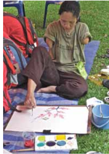
Figure 7: Artist painting with her feet.

Professional artists were the leaders of the numerous visual art, music, and dance activities offered every day. This reminded me of a statement a professor of special education made at a conference a few years ago: “If one can only teach one musical idea or concept, let it be Mozart.” This is exactly what was being offered at the Art for All camps. The campers circulated through a number of activity stations and were exposed to some of the very best traditional Thai music and dance.