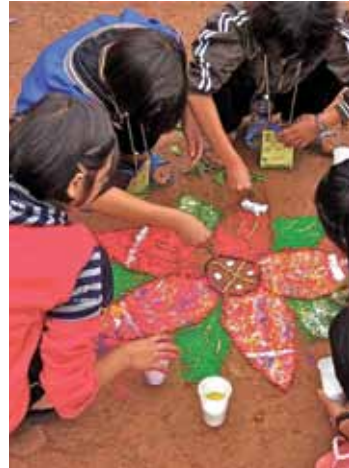
Figure 3: Hill Tribe group paints on the earth using dry tempera paint.

This was a basis for showing the campers just how important they are and how important their culture is. The Art for All camp I observed had a focus on the use of artistic materials that were available in the villages. Thus, straw became a material for making animals and baskets. The ground became a canvas for drawing with tempera, and for using leaves, and other nature objects to create pictures.