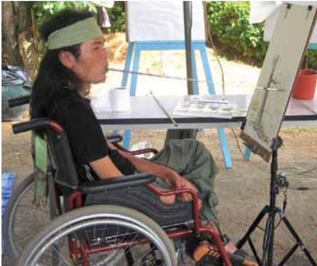
Figure 6: Hill Tribes Straw animals (a readily available materials).