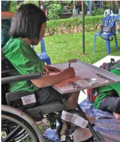
Figure 15: Girl drawing on a lapboard.

During another art activity, I noticed a girl in a wheelchair drawing. With the help of an interpreter I asked her how she was selected for the camp. She told me that she had always liked art and had asked her teacher if she could attend the camp.