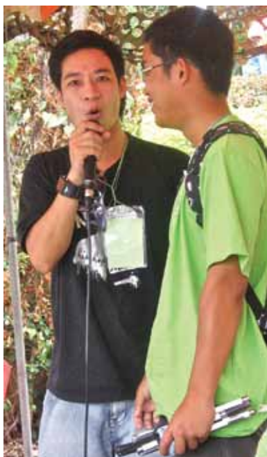
Figure 14: Boy who is blind (on the right) being interviewed about his Art for All experience.

In one activity a well-known television reporter was interviewing campers while they were video taped. The aim was to increase self-esteem and to encourage campers to talk. One fellow who was blind stood up and told the reporter that this was his first Art for All camp. He was so motivated by his experience that he said he wanted to study law and become an advocate for persons with disabilities.