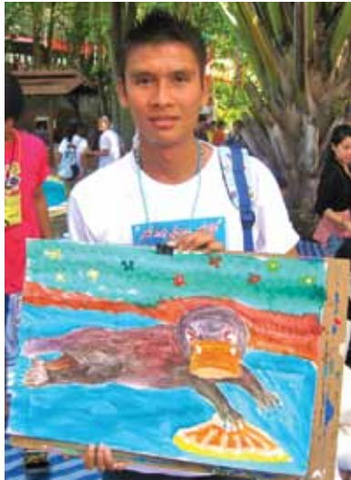
Figure 13: Boy showing his painting of a platypus. He is hearing impaired and has had some art classes.

This next photo shows a teenager and his painting of the platypus. He was in the same group and is hearing impaired. He “said” he had studied art.