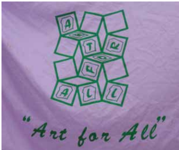
Figure 1: Art For All banner.