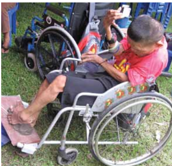
Figure 17: Boy using his feet to manipulate clay.

Finally one inspiring moment occurred during a clay activity. One boy who was in a wheel chair had almost no control of his arms. Two volunteers removed his shoes and placed clay on a board so he could manipulate the material with his feet. These images speak to the excitement that this camper experienced as he used his toes to move the clay.