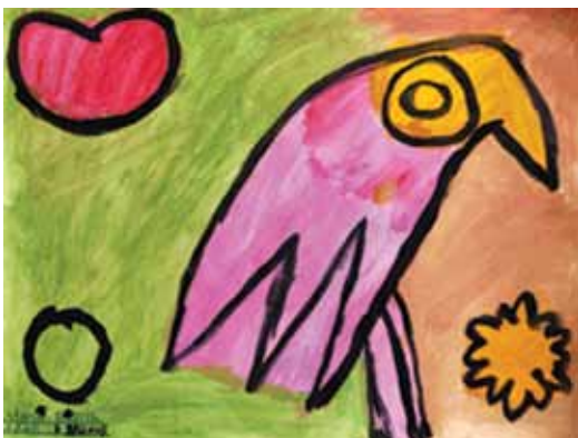
Figure 26: Crazy Bird Acrylic on Paper by Maria Radilla. (c) NIAD. Reproduced by permission of the National Institute of Art and Disabilities. ( http://www.niadart.org/Pages/Radilla.html )