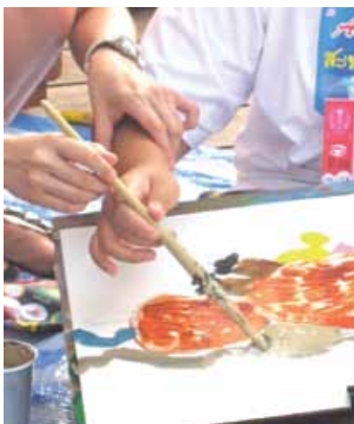
Figure 11: Volunteer hands a paint brush to the girl so she can finish the painting.

It was amazing to see this camper execute the painting.