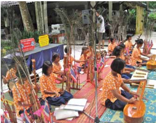
Figure 8: Traditional Thai Musicians. The group of children has received recognition from the royal family.

Professional artists were the leaders of the numerous visual art, music, and dance activities offered every day. This reminded me of a statement a professor of special education made at a conference a few years ago: “If one can only teach one musical idea or concept, let it be Mozart.” This is exactly what was being offered at the Art for All camps. The campers circulated through a number of activity stations and were exposed to some of the very best traditional Thai music and dance.