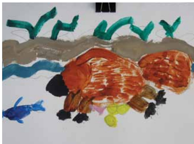
Figure 12: This is the very first painting the girl who is blind created. (c) 2009 Anderson. Reproduced by permission.