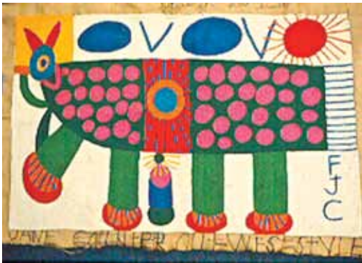
Figure 21: Stitchery by CF.