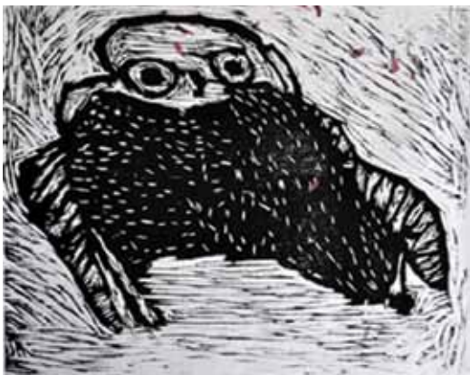
Figure 25: Woodcut by Ray Brown (c)NIAD. Reproduced by permission of the National Institute of Art and Disabilities. ( http://www.niadart.org/Brown_Ray_bio_bw.html )

Additionally NIAD has a gallery and describes the artist's work as outsider art. There is also an electronic gallery of artwork by its artists. The NIAD is another model of a creative community for adults with a variety of disabilities.