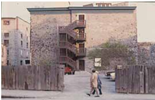
Figure 19: Warehouse where Le Fil d' Ariene is located.

The setting for this workshop is in a beautifully renovated warehouse in the old part of the city. The setting itself is inspiring.