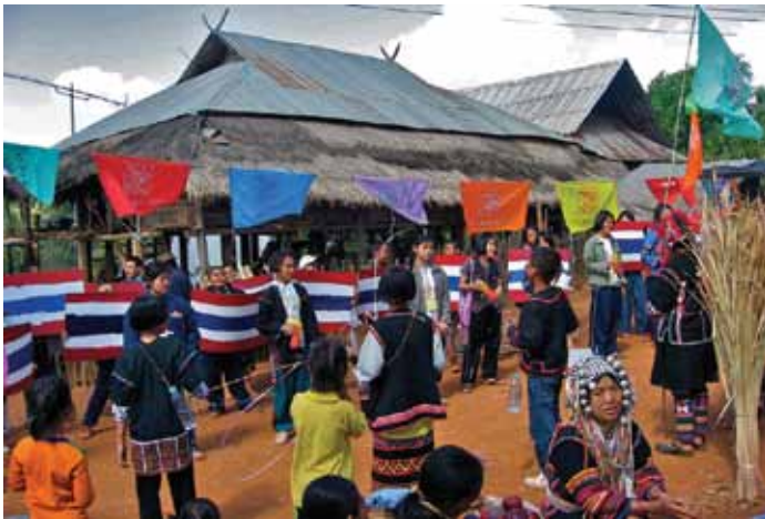
Figure 2: Art for All in Akha camp.

I have been a participant-observer at three of the Art for All Camps. In 2008, I observed the hill tribe Art for All Camp in Northern Thailand. The hill tribes have had a long history of marginalization. The mainstream Thai culture has held prejudicial attitudes toward these hill tribes. This camp focused more on instilling an appreciation and reverence for each camper's tribal culture. By making an effort to focus on tribal traditions, and by making the effort to bring Art for All to one of the tribal villages, the participants began to realize their own importance.