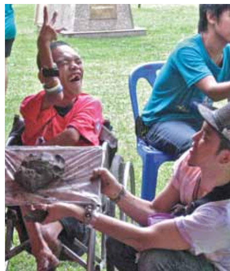
Figure 18: Boy showing his excitement about what he has made.