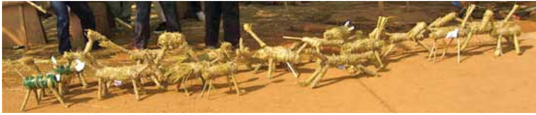
Figure 4: Hill Tribes Straw animals (a readily available materials).