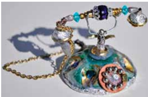
Figure 27: Telephone mixed media by Jean McElvane (c) NIAD. Reproduced by permission of the National Institute of Art and Disabilities. ( http://www.niart.org/Jean_McElvance_bio_bw.html )