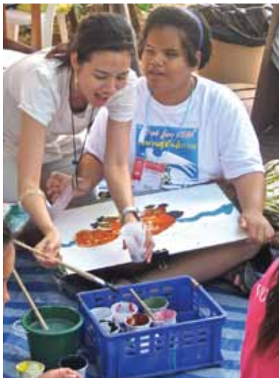
Figure 10: Paint is being mixed for the girl who cannot see (on right).

I am often asked about the efficacy of having persons who are blind included in two-dimensional activities. As an answer I offer the following. In one painting activity a group of campers were told about the duck-billed platypus that is a strange animal that lives in Australia. Pictures of this animal were shown. (Note: the presenter had tried to bring a stuffed toy in the form of this animal, but was unable to locate one). I noticed one girl that was completely blind. There was a volunteer helping her. The girl used her hands to figure out where on the page she was going to paint the duck-billed platypus. Then the volunteer gave her a paintbrush and told her what color paint was on the brush.