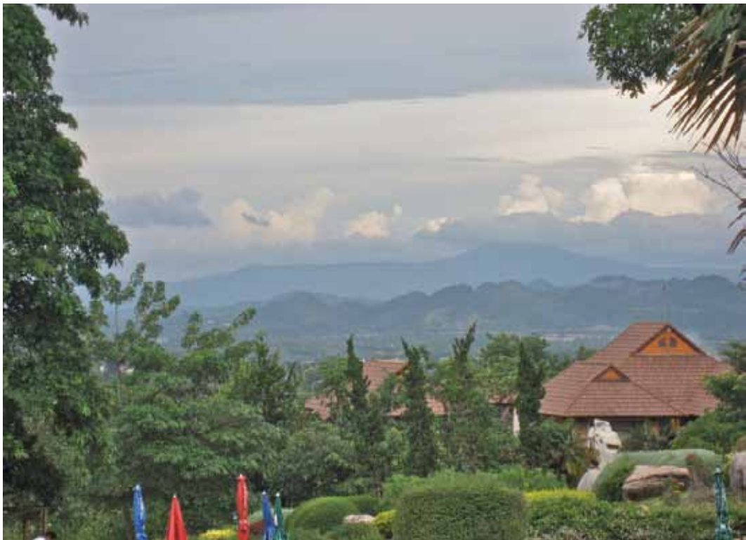
Figure 5: Setting for one of the Art for All July camps.

I have been able to be a participant-observer of two very large Art for All camps held in July 2008 and July 2009. I witnessed the effects of the beautiful settings in which each was held. This immediately put campers in a very different and inspiring surrounding.