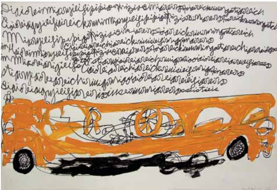
Figure 23: Drawing by Dwight Mackintosh.

Thirty-five years ago in Oakland, California Creative Growth was established. I had the good fortune to visit this special place. It is set in a huge urban storefront. It is a very busy place with one section where life skills classes are held. There are several other sections where the artists can work.