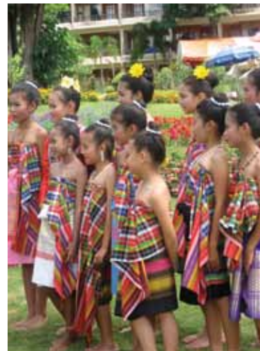
Figure 9: Traditional Thai Dance Group. (c) 2009 Anderson. Reproduced by permission.