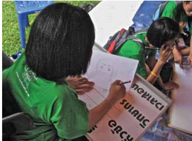
Figure 16: Here is what the girl is drawing. (c) 2009 Anderson. Reproduced by permission.

As the reader can see, this girl was quite a good artist for an 11 year old.