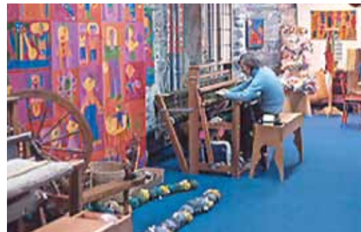
Figure 20: Inside the workshop.

Art therapy is also used to help the artisans deal with emotional issues such as frustration, anger, and disappointment. No artwork produced during the art therapy sessions is ever used for a retail textile.