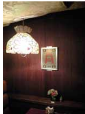
(b) Restaurant Lima