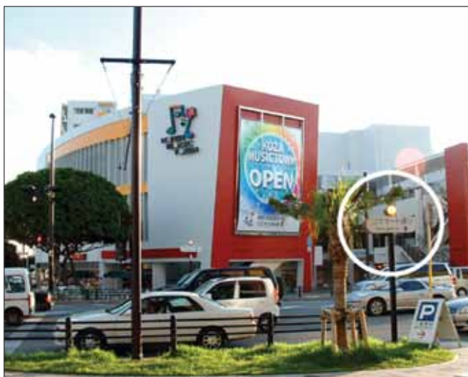
Figure 5: Koza Music Town and the restored street name (Koza Gate Street).

Under a severe economic decline and the limit of usable space in Koza, the Okinawa City government has shifted attention to Koza's placeness or militarized culture and history. They now attempt to reassess what U.S. military presence has brought about to Koza and what kind of implication it has for people in Koza. In reassessing the culture and history of Koza, the Editorial Division of the History of Okinawa City has been playing an important role. It has collected and published postwar historical materials since the 1990s. The books they have published represent Koza's unique placeness constructed through complex and uneven social, economic, and political relations between Okinawans and the U.S. military.