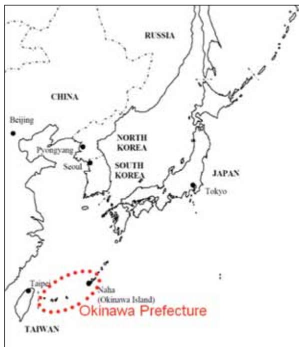
Figure 1: The location of Okinawa Prefecture.