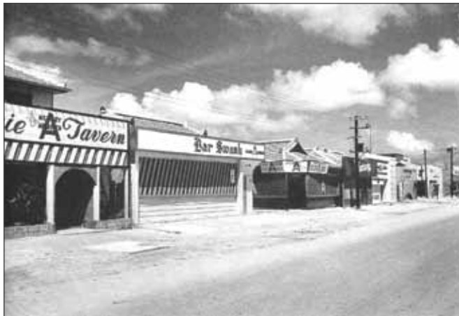
Figure 4: Bars and restaurants on Gate Street in the early 1950s.

Americanized Okinawan music fostered in bars and clubs for U.S. personnel. As the facility was built, the City government officially reused the name of Koza for the facility and renamed Kuko Street to Koza Gate Street. Figure 5 is a photo of Koza Music Town on former Kuko Street. The street name is now shown as Koza Gate Street. I argue that changes such as these represent a re-appreciation of the militarized placeness of Koza.