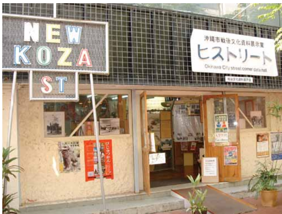
Figure 6: The façade of Histreet

Unlike the gorgeous prefecture and national museums in Okinawa, Histreet has free admission and is very accessible to local people as well as tourists. It exhibits many kinds of things and photos of incidents related to the postwar lives of people in Koza. There is no clear order in the exhibition so that visitors feel as if they were thrown into a toy box. But, local visitors can enjoy finding something they knew in the past. Therefore, this museum is often used for reminiscence therapy for the depressed elderly.