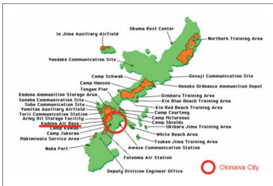
Figure 2: U.S. military bases and installations, 2004.