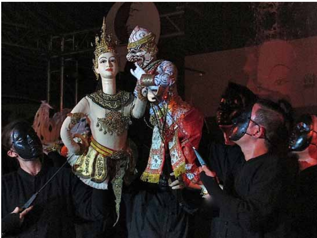
Figure 3. The Kamnai Puppet Troupe of the Phasi Charoen District.

a. Ancestral mode: This is the traditional form where cultural heritage is passed on down through the generations by ones ancestors. The contemporary owners have learned it from family or community elders who were masters of the art or well-known regional artists. Some examples are the Thai-styled antiphon bands