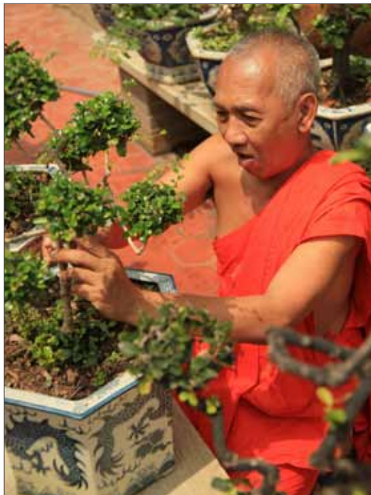
Figure 6. Thai style bonsai at the Wat Khlong Toei Nai temple in the Khlong Toei District.

a. Continuation of ancestral skills: The crafts have been learned from one's ancestors or under the apprenticeship of a master. Craftsmanship is a complicated art, requiring meticulousness, dexterity, and a great deal of experience to become a master craftsman. Some examples from the Phra Nakhon District are the gold smiths that produce gold leaf at Bahn Gold Leaf and the Thai Theatrical Costumes by Bahn Mae Piak. The Buddhist alms bronze bowl makers in the Bangkok Noi District and the Thai style of Bonsai at the Wat Khlong Toei Nai Temple in the Khlong Toei District.