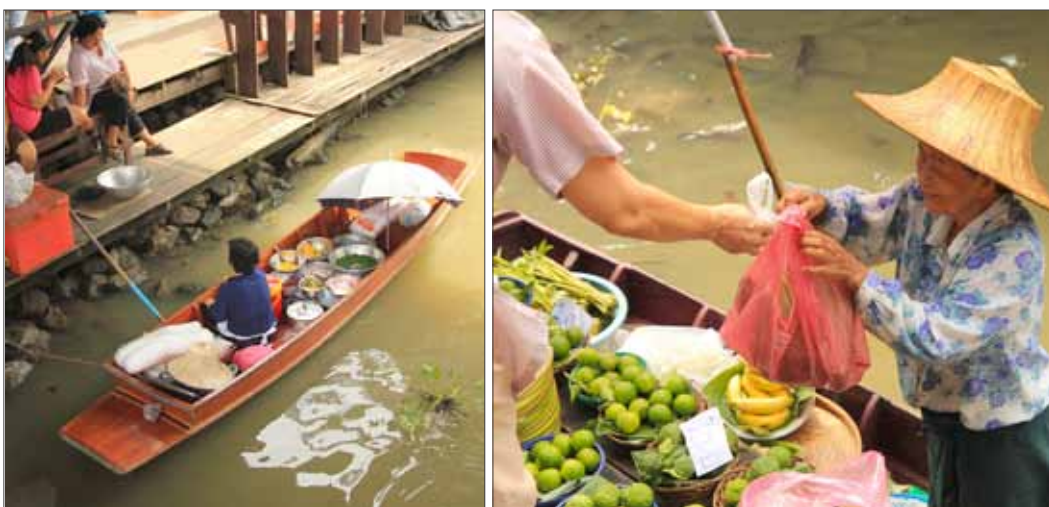
Figure 7. The Taling Chan floating market - Taling Chan District.

c. Markets with expanded community involvement: These are markets with additional commercial or tourism focuses making them a theme destination. For example, a governmental agency helped develop the Taling Chan Floating Market of the Taling Chan District into a tourist attraction. There is also the Leng Buay-Ia Market, which is a center for fresh food and famous restaurants in the Samphanthawong District and the Soi Aree Market that offers ready-made food and is home to several famous restaurants for office workers in the Phaya Thai District.