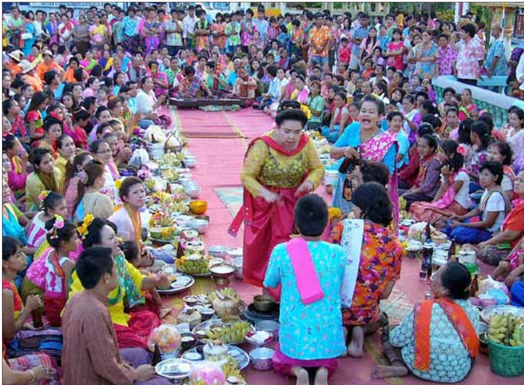
Figure 4. The Songkran Mon tradition of the Bang Kradi community in the Bang Khun Thian District.

There are also the significant Buddhist days such as the Vesakha Bucha Day, Asanha Bucha Day, and Buddhist Lent. Some temples hold other annual traditions such as the Chak Phra in the Bang Sue District where there is a parade with a statue of Buddha. Other examples are the traditional long-tail boat race of the Bang Na District, the Pid-thong Wai-phra festival in the Lak Si District that involves showing respect to Buddha and applying a renewed layer of gold leaf to his figure, the Songkran festival of Wat Rama IX Kanchanapisek in the Huai Khwang District, a Buddha's relics celebration at the Wat Saket Temple located upon the Golden Mountain in the Pom Prap Sattru Phai District and the Tan Kauy Salak tradition that involves a group offering where one person is selected by lottery to make the donation at the Marble Temple in the Dusit District, and the Artipuja Ritual for paying homage to the Hindu gods and a lamp greeting ceremony at the Wat Witsanu Temple in the Sathon District.