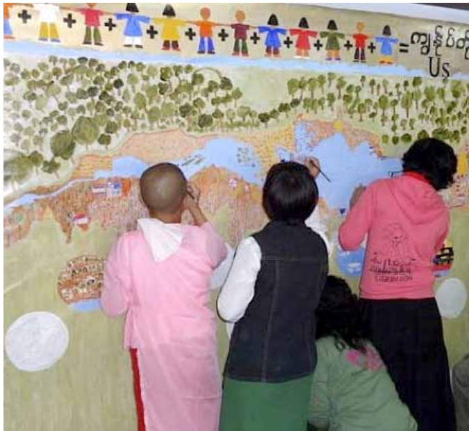
Figure 2. Children painting an environmental art wall mural at Inle Speaks, Nyaung Shwe.

In the coming 2015 year, Partnership for Change and Inle Speaks plan to support the new traditional Inle Music festival, collaborate on a Shan “Culture House” renovation project, and a “Green School” pilot for bamboo architecture.