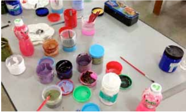
Figure 5. The painter's table at Inle Speaks, Nyaung Shwe.

In complex and challenging situations such as the urban core of Myanmar, it is sensible to learn about the bureaucracy in less chaotic locales. PfC has successfully done small projects in “non-urban” areas and is now ready to apply those learnings to the complex opportunities of Yangon.