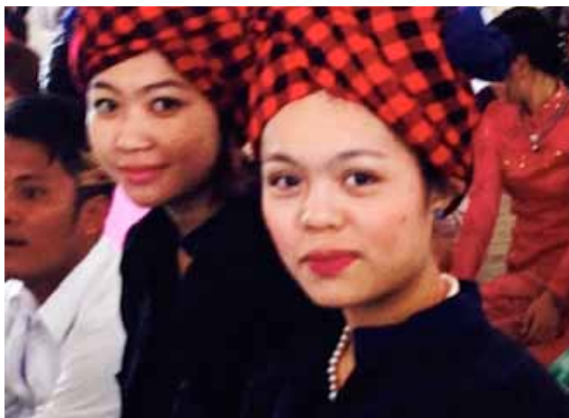
Figure 3. Participants from the Pa O tribe ready to perform a traditional dance at the summer ESL Immersion program.