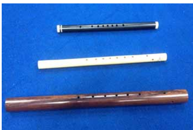
Figure 2. Photos of the Khlui Lip (top), the Khlui Phieng-or (middle) and the Khlui Ou (bottom).

in speed (Fast tempos), feelings of happiness, excitement, wonder, anger or fear will be stirred. If the music's tempo is reduced in speed (Slow tempos), feelings of sadness, silence and gentleness are felt. The sound level (Pitch) is related to the frequency of the musical sound, which can be measured in rounds per second. These are both high pitched (sharp) and low pitched (deep-toned). The use of a high pitch can create a sense of grandeur, imagination, excitement, anger or fear. The use of a low pitch can create a sense of sadness, boredom, dignity or violence. Sound control (Articulation) is a way of making musical performance communicate emotions to the audience, for example, staccato notes are very short and crisp can create an atmosphere of fun, joy, fear or anger and Legato notes are long and connected can create an atmosphere of sadness, gentleness, softness or violence (Farrar, 2003).