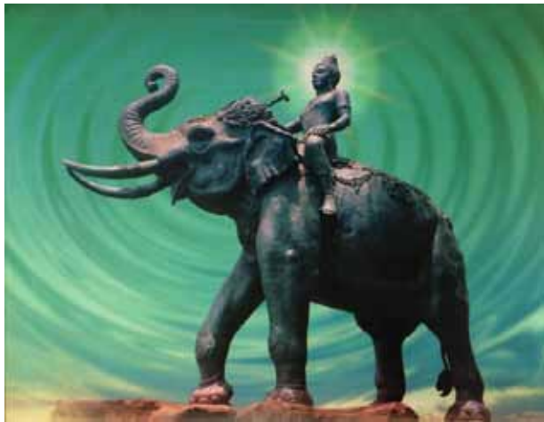
Figure 1. Phra Phutha .

Methods employed in Phra Phutha repertoire aims to narrate emotions expressed in the characteristic of Phra Phutha. The Chaloe Triphob Doctrine states that the God Issuan created Phra Phutha from seventeen large elephants. (See Figure 1) Through the God's magical powers, the elephants were ground into refined powder and the powder was wrapped in a leaf-green cloth, sprinkled with divine water, from which Phra Phutha arose to become one of the Nine Planetary Deities of the auspicious type, who would yield a sense of gentleness and sweetness (Wisandaronkorn, 1997). For this reason, those born on Wednesday, or Wan Phutha in Thai, are reputed to be gentle in behavior, polite in manner, sweet in words and witty in talk or discussion in the same way as the "God of Rhetoric". The main characteristic of Phra Phutha is "communication and talk" in the same way as Hermes or Mercury, the God of Medicine and Communication, a son of Zeus and Maya, in Greek mythology. Therefore, the style and melody of Phra Phutha repertoire will show his communicative strategy through sweet and gentle words.