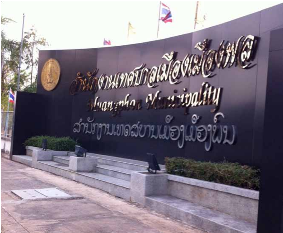
Figure 9. MPM municipality main sign (front entrance).