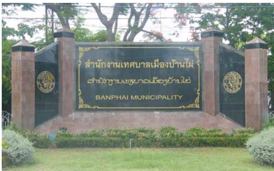
Figure 13. BPM municipal main.