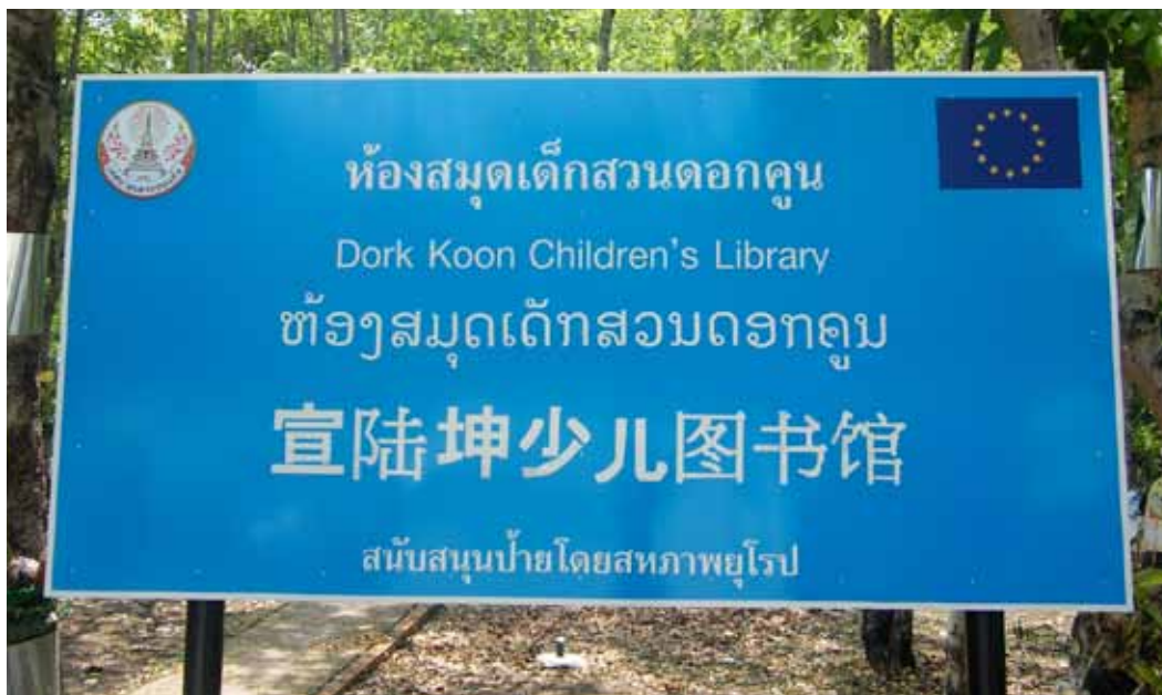
Figure 15. KKM main municipal library sign (within Kennakorn Lake Park).