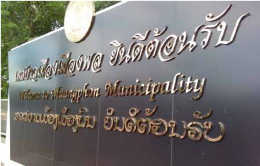
Figure 11. MPM municipal main sign (side entrance).