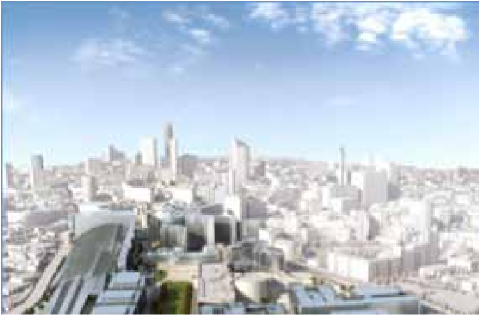
Figure 5. CPM place sign.

The place signs for MPM, an example of which can be seen below, also employs the top-down Thai, Thai Lao, English design pattern. The most outstanding aspect of the place sign appears to be the non-standard use of an outline script in the case of all three fonts, indicating some artistic leeway in the design process. An obvious indexical picture of the place exists above the inscription.