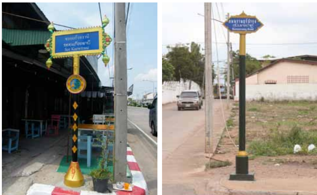
Figure 3. Left, BPM road sign. Right, CPM road sign.

Coded information for the visual and place semiotics of the signage is presented in tabular form for ease of reading and comparison. The use of Thai Lao is flagged as potentially transgressive (similar to graffiti) throughout because Thai Lao is never normally used in official signage. This is the first official municipal multilingual signage to include Thai Lao and may be interpreted as transgressive, even subversive, despite being the language of an officially recognized ethnolinguistic group of Thailand. To begin, we can see both ornate (BPM) and standard (CPM) Thai road signs. However, both signs have a standard top-down reading, with the most important language, Thai, the national language, higher and in the case of the CPM road sign, slightly larger because of the bold font. Then, the 'local' script, Tai Noi , representing the Thai Lao heritage language of the majority of the community, is in the middle. English, the international language and of least relevance to the local people, despite its promise of future enhanced opportunities if mastered, is at the bottom. The Thai in the CPM sign is a non-standard font and indicates some artistic leeway granted in the design process.