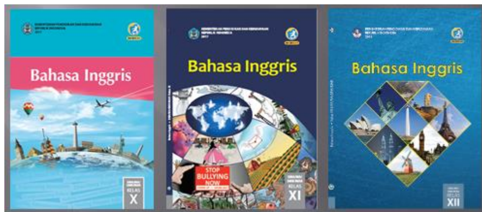
Figure 1. Online English Textbooks Provided by the Indonesian Government

Finally, religions of the figures were identified only when there was a clear indication of religious affiliation of the persons. Typically, female figures wearing hijab were identified as Muslim while other female figures were not marked as they did not appear to affiliate to a certain religion.