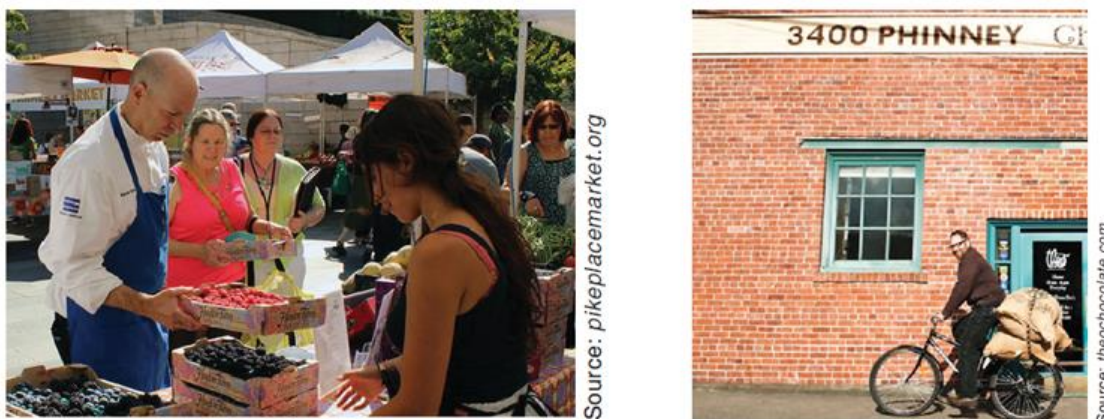
Figure 4. Sample Illustrations Representing International Culture

illustrations may enhance the ideology of neutral English language teaching. In contrast with the national language that serves as a unifying element in the nation's building after the Dutch colonialism, English is considered high power language and the middle class language of modern communication (Lauder, 2008; Lie, 2002, 2017).