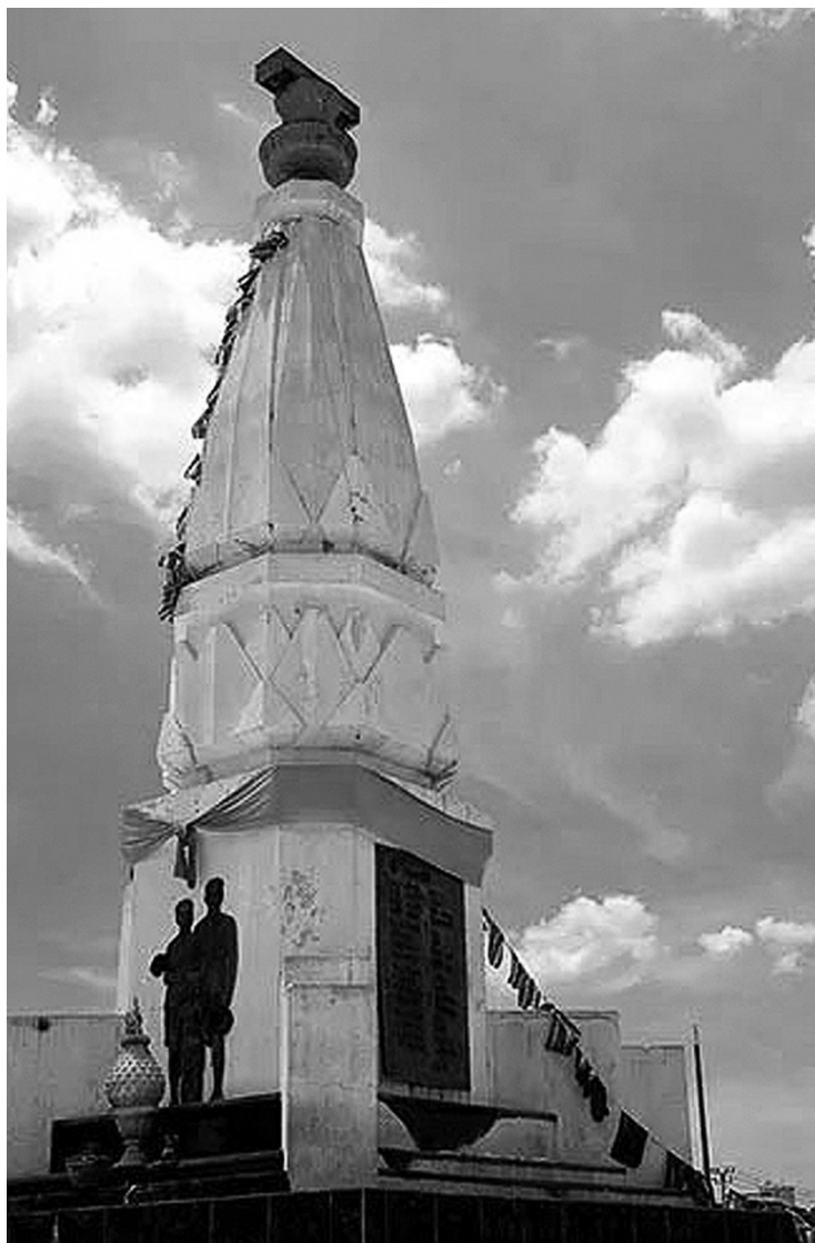
Figure 3. List of the Seventeen Martyrs and image of the ideal Thai family

Envisioning the nation and constitution as a new focus of public loyalty for Thai citizens, consisting of various ethnic groups, the socialist-oriented Pridi believed in a liberal version of nationalism. On the contrary, the fascist-oriented Phibun advocated a militarized one. 46 Phibun's faction promoted a strong military leadership to govern a well-ordered society and a civilized nation-state, populated predominantly by the Thai race. In doing so, they modified King Rama VI (Vajiravudh, r. 1910-1925)'s concept of the Thai nationhood--centering on nation, religion (Buddhism), and monarchy--but substituted the