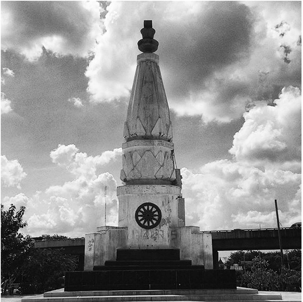
The Constitutional Defense Monument

พิธีทักขิรัฐธรรมนุญกับการทำหน้าทีสถาปัตยกรรมที่สนองตอบต่อการแสดงอำนาจและความชอบธรรมทางการเมืองให้แก่รัฐ รวมทั้งปัจจัยทางการเมืองซึ่งก่อให้เกิดการเปลี่ยนแปลงความหมายและการเลื่อนความสำคัญของอนุสาวรีย์แห่งนี้ ประกอบกับความเคลื่อนไหวทางสังคมโดยภาคประชาชนที่ส่งผลให้อนุสาวรีย์พิธีทักขิรัฐธรรมนุญกลับมาได้รับการจดจำในฐานะของพื้นที่แห่งความขัดแย้งและการต่อสู้ทางการเมืองอีกครั้งหนึ่ง