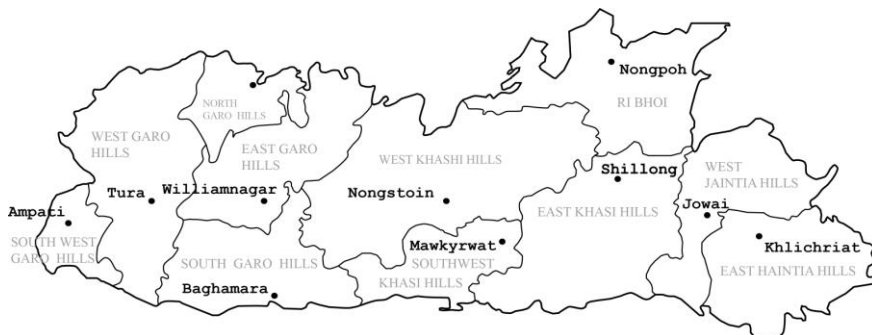
Map 2 The area where Lyngam is spoken in the West and Southwest