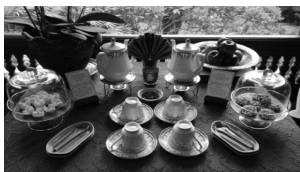
Figure 2 The welcome drink that made from the local herbs product in northern of Thailand

Aromatherapy is recognized by inhalation. Identity of Lanna Spa is created by aromatic plants. This use flowers to decorate the building or float in the bath so that the natural scent and some can reduce odor. Some flowers, including Indian cork tree, Amomum biflorum Jack, and Vetiver grass, can be used to make incense aromatherapy candles in the spa. The natural aroma of these makes consumers feel pleasure and relaxation. That's shown on figure 3