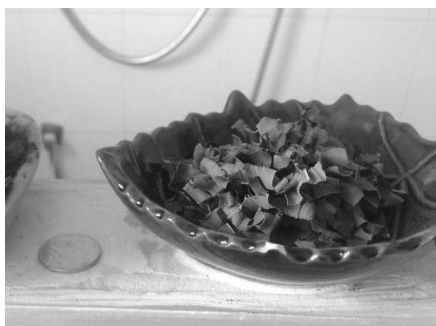
Figure 3 The unique aroma in spa business