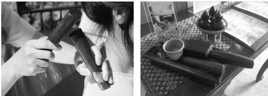
Figure 5 Toksen, the Lanna wisdom of massage

Touch: the identity of Lanna spa focuses on a massage or traditional Northern Lanna with elements of acoustic music, including smell and taste. There is also a Lanna Exotic massage comprising with Thai massage which focuses on the press, repeat, and squeeze. It begins with massaging the feet to the back of body, and an elegant style of Lanna massage, massage hammer line by a spine shoulder and massage oils. Ending services with the Lanna Exotic massage.