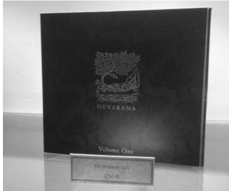
Figure 4 The identity of Lanna spa through hearing by Lanna instruments

Sound is perceived through hearing. Identity Lanna spa is trying by bringing a mix Lanna voice instruments, as known of Salor Sor Sung. Upon entering the spa, consumers will feel relaxing and listen to music during a spa treatment.