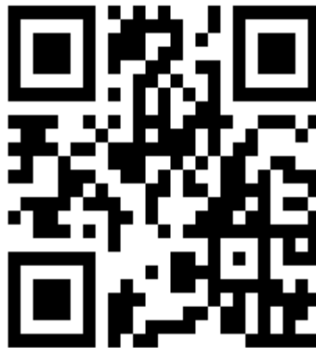
Figure 2: QR code with the Sim game

1. To receive the model digital media prototype with the Sim game of the hotel for consumers in the Lower Northern Provincial Cluster 2 and design under the conceptual development of the Sim game of the hotel business simulation from the initial definition. This QR code was designed to create jobs and video shows. You can scan this QR code and it will present with a video file. This is prototype development by the Sim game. It is a simulation environment for the hotel for consumer Figure 2.